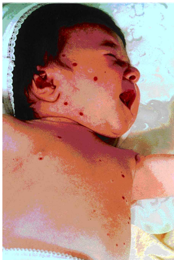
Fig. 1. Multiple cutaneous hemangiomas on the face, trunk and limbs.

A 40-day-old girl was referred to our clinic for the evaluation of pink papules on her face, trunk and limbs (Fig. 1). She was delivered vaginally at term by a 21-year-old mother and had a birthweight of 3,300 g. There was no family history of hemangiomas, congenital