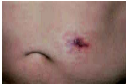
Fig. 1. One week after injection of pegylated interferon- \alpha -2b, the injection site shows a well-demarcated brownish-red surface, 1.5 \times 1 cm in size, overlying a deep, tender infiltrate. Typical "blitz figures" surround the injection site.

Interferon treatment could be continued without modification and was well tolerated. However 2 months later, the patient again developed a painful lesion, this time on the right abdominal wall shortly after a PegIntron ® injection. Topical heparin ointment and oral NSAIDs were ineffective and the lesion was therefore removed surgically, sutured and healed without complications.