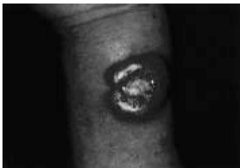
Fig. 1. Clinical appearance of the tumor on the patient's right wrist.

In February 2001 a 68-year-old man presented with a 1-month history of skin tumor on his right forearm (Fig. 1). The tumor had developed rapidly and presented as a solid, reddish-violet, circumscribed, 4.3 × 3.9 cm mass. In the center of the tumor there was a 1.4 × 1.9 cm ulcer. There was no lymphadenopathy.