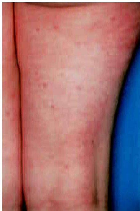
Fig. 1. Typical "porcelain-white" skin lesions occurring in large numbers on the calves of the patient at varying stages of development.