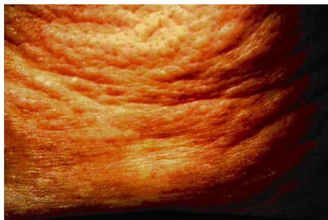
Fig. 1. Multiple, linear, flesh-coloured papules on the back of the neck.

The case presented is of interest on 2 counts: firstly, because of the rarity of the pathology, discrete LM not associated with paraproteinemia; and secondly, because of its association with a virus C hepatopathy. Such an association has been revealed in a Japanese study (5), in which of the 16 LM cases reported, 8 showed liver dysfunction with anti-HCV antibodies, while only 3 cases showed paraproteinemia. The authors maintained that this association of pathologies had only been seen in Japan, with the exception of a case described by Rongioletti & Rebora (6). Our case, therefore, is only the second non-Japanese report of LM associated with HCV. This infection could be the trigger for the stimulation of some unknown serum factor that determines fibroblast