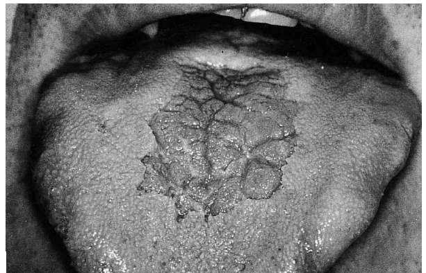
Fig. 3. Large porokeratotic lesion on the dorsal tongue.

To be able to classify a disseminated porokeratosis without a distribution suggesting sun exposure, not affecting the