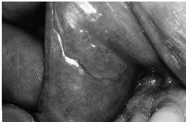
Fig. 2. Porokeratotic lesion on the buccal mucosa.