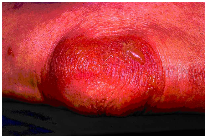
Fig. 1. Well-demarcated erythematous lesion of the knee studded with vesicles and small bullae.

fludarabine. Some days prior to consultation she had applied ketoprofen gel (Ketum) on her knees on two occasions to relieve arthralgia. Within a matter of hours she developed pruritic, well-demarcated, erythematous lesions over both knees, which later became studded with vesicles and small bullae (Fig. 1). On examination an additional erythematous lesion was found on the thigh. The mucous membranes were unaffected. The vesicles and bullae subsided as a result of local steroid treatment but the erythema persisted on the knees for the next 10 days. Histologic examination of a skin lesion showed a moderately acanthotic epidermis. Several deeply-seated intraepidermal vesicles were found, whose floor consisted of a single row of basal keratinocytes. The vesicles were occasionally coalescing into small blisters and contained many eosinophils (Fig. 2). The underlying dermis contained a mild inflammatory infiltrate composed of lymphocytes and eosinophils. Direct immunofluorescence performed twice on perilesional skin (at the initial consultation and 10 days later) showed deposits of IgG and C3 on the surface of epidermal keratinocytes, i.e. an aspect of autoimmune pemphigus.