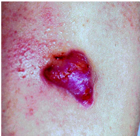
Fig. 1. The nodule (3 cm in size) on the left upper arm in the sulcus over the insertion of the left deltoid muscle.

studies were negative for mycobacteria. No antituberculous therapy was administered. Treatment with curettage was performed and the lesion healed within 3 weeks, without scarring. No recurrence was seen 2 years later.