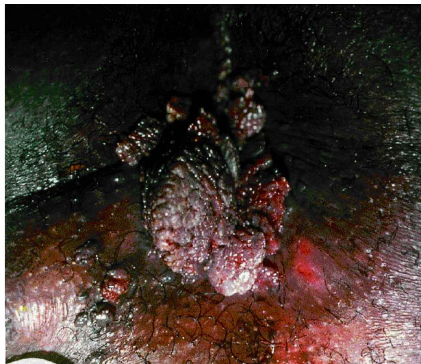
Fig. 1. Perianal condyloma prior to treatment.

Gilson et al. (8) reported a study conducted in HIV-positive patients to assess the efficacy and safety of topical imiquimod for HPV infection in these individuals. It was concluded that there may indeed be some clinical utility of imiquimod in these