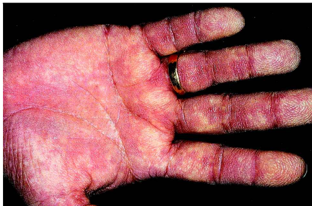
Fig. 1. "Tripe palms" with well-demarcated hyperkeratosis and accentuation of the normal skin markings on the palm.

As a result, we started a thorough search for tumours including tumour markers and a slight elevation of neuron specific enolase was found (7.4 ng/ml; normal < 5 ng/ml). A temporary increase in serum cortisol occurred, which may have resulted from her intake of oestrogen after the hysterectomy, and thyroid-stimulating hormone levels were raised. This was checked using a thyrotropin-releasing hormone test, and turned out to be within the normal range. The cortisone-releasing test was also within the normal range. The only laboratory abnormality found during the 3-year follow-up period was hyperinsulinism as an indication of insulin resistance. The elevated cortisol was also further investigated by an X-ray of the sellar region, but no abnormalities were found. During the past 3 years the patient has been repeatedly assessed using computer tomography, magnetic resonance tomography, positive emission tomography, sonography of the abdominal region and lymph nodes, gastroscopy, colonoscopy and X-rays, but no abnormalities or signs of a tumour have been detected.