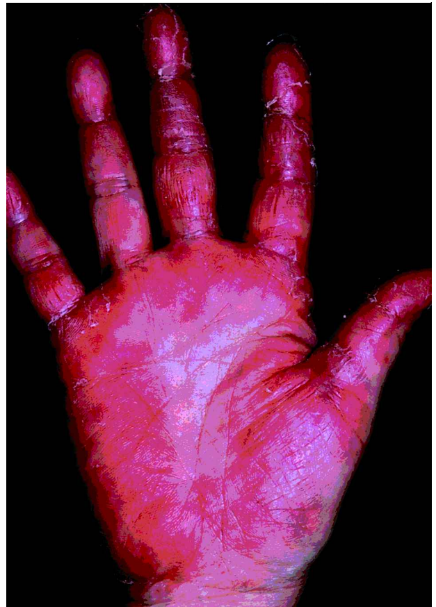
Fig. 1. Typical dusky red palmar keratoderma.

The skin lesions were treated with 0.05% fluocinonide cream and 10% urea cream, and the effect was slight and transient.