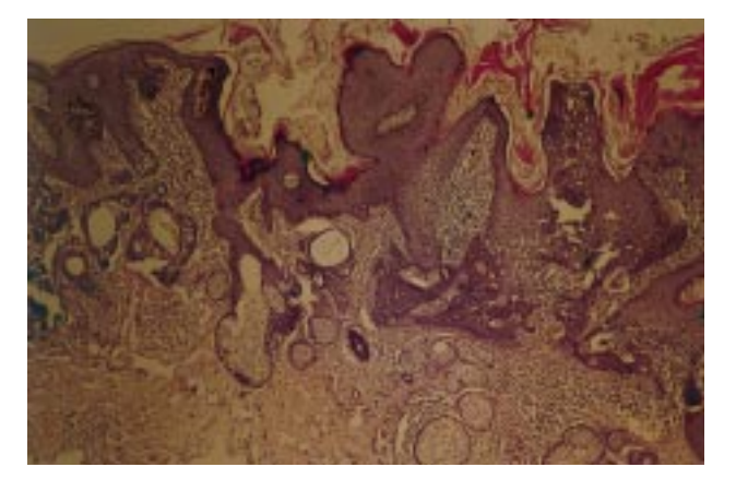
Fig. 2. Biopsy from the centre of the lesion, showing hyperkeratosis, parakeratosis, acanthosis and papillomatosis. Budding of basaloid cells invading the dermis is seen in the centre and on the left edge of the photomicrograph. (H & E stain \times 40 ).

frequently in naevus sebaceus and syringocystadenoma papilleferum, but rarely in verrucous epidermal naevi (1). To the best of our knowledge, only 7 case reports, comprising 8 patients (7 men and 1 woman), have so far been published in the world literature in which BCC appeared in a verrucous epidermal naevus (2–8). Five of these cases are from western countries and one from Japan. All of the patients had fair skin. Verrucous epidermal naevus was present on the exposed areas of the body in 5 patients (2, 4–6). The naevi were localized in 3 patients (4, 6) and extensive or generalized in 4 patients (2, 3, 5, 7). Multiple BCCs arose in 4 patients (3–6). In 3 patients, squamous cell carcinoma also developed along with BCC within the verrucous epidermal naevus (2, 3, 8). A history of preceding trauma, such as excision, electrocautery,