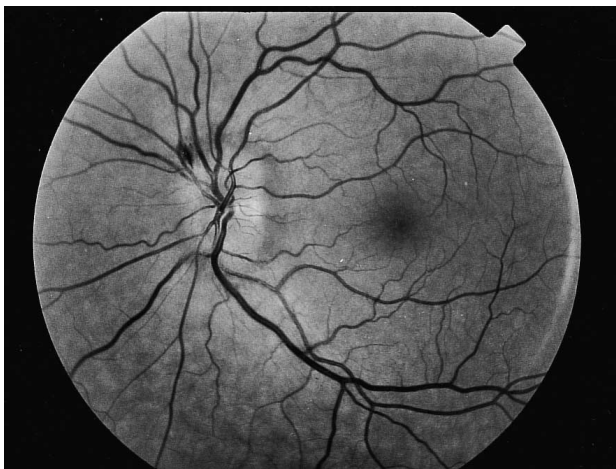
Fig. 1. Blurred optic disc margins and a superficial flame-shaped haemorrhage at 11 o'clock position in the left eye of case 1.

Her medical history was unremarkable. She revealed several erythematous, painless, oozing papules with partially papillated surface in the anogenital region and a generalized lymphadenopathy. Dark-field microscopy of the lesions showed the presence of spirochetes. Routine laboratory investigations revealed a serum TPHA of 1:2560 and a positive (4+) fluorescent Treponema pallidum antibody absorption. Lumbar puncture demonstrated a normal