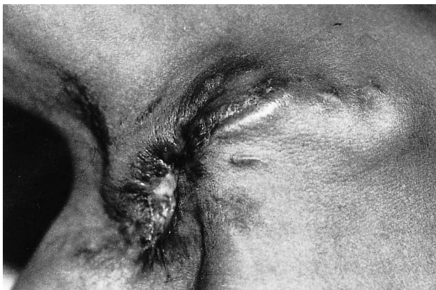
Fig. 1. Nodular, lobulated subcutaneous swelling with central ulceration and well-defined margins in the right axilla.

The haemogram, biochemical tests for liver and kidney functions, urine and stool examinations were within normal limits. Montoux was 4 × 4 mm. An ELISA test for HIV was negative. Fine needle