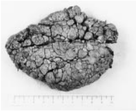
Fig. 1. Macroscopic appearance of the tumour.