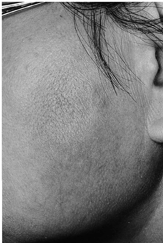
Fig. 1. Clinical picture at initial examination, showing a slightly erythematous nodule in the left pre-auricular region.

dysfunction. In December 1991, her liver function deteriorated acutely. At that time, levels of aspartate aminotransferase, alanine aminotransferase, \psi -glutamyl transferase, alkaline phosphatase and lactate dehydrogenase were 754 U/l (normal range 0–35), 818 U/l (0–35), 82 U/l (0–60), 228 U/l (80–230) and 480 U/l (250–500), respectively. No serological changes for hepatitis B virus surface antigen and hepatitis C virus antibody were found. On laboratory testing, many lupus erythematosus cells and elevation of immunoglobulin G (IgG, 2.28 g/dl; normal range 0.70–1.70) were found. The lupus erythematosus cell factor and antinuclear antibody were positive (homogeneous and speckled pattern, \times 80 ). Rheumatoid factors, antimitochondrial antibodies, anti-smooth-muscle antibody, antibodies to liver–kidney microsomes and anti-U1 ribonucleoprotein antibodies were not detected. Liver biopsy revealed extensive lobular infiltration with lymphocytes and plasma cells and shortening of the distance between portal veins (P–P bridging) as a result of