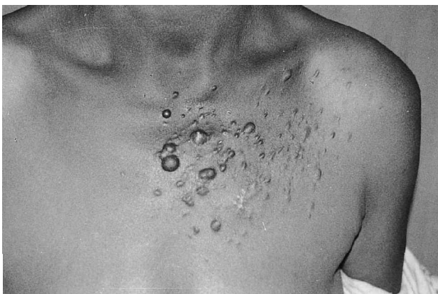
Fig. 1. Multiple, erythematous, skin-coloured papules and nodules confined to the left upper chest.

Cutaneous leiomyomas are benign smooth muscle tumours derived from arrector pili muscle, media of blood vessels and dartos muscle of the scrotum, vulva or nipples. They are classified into 3 types according to their site of origin, namely piloleiomyoma, dartoic leiomyoma and angioleiomyoma (1, 2). Piloleiomyomas are firm, painful, intradermal nodules, most commonly seen in early adult life with equal incidences in males and females (1). They are usually multiple, and occur over the face, anterior trunk and the extensor surface of extremities (1, 2). They range in size from a few millimeters to >1 cm and the colour varies from pink to yellow or brown