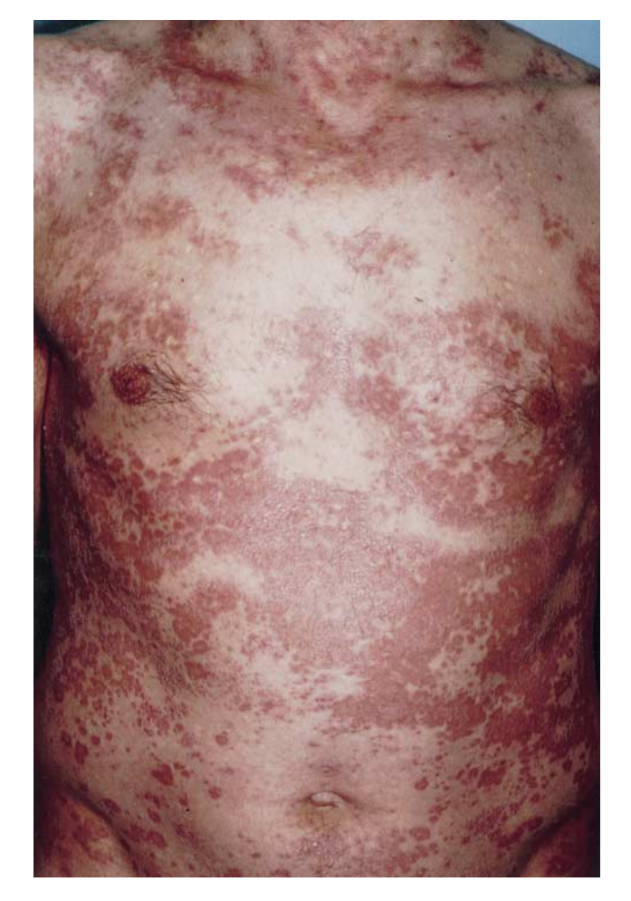
Fig. 1. The patient's trunk showing generalized GA. Note the widespread arcuate red-purple papules varying from 3 mm to 7 mm in diameter.

The results of routine laboratory studies were within normal values (complete blood count, erythrocyte sedimentation rate, serum glucose, ions, liver enzymes, C-reactive protein, antistreptolysin-O-titre and urinalysis). Chest X-ray and abdominal ultrasound were also normal. Histological examination of an excised papule showed circumscribed necrobiotic foci of degenerated collagen fibres in the upper dermis, surrounded by palisading inflammatory cells. The infiltrate consisted mainly of histiocytes and a mixture of monocytes, foreign-body type giant cells, some lymphocytes and fibroblasts. The diagnosis of general-