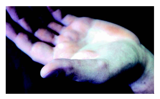
Fig. 1. A nodule on thenar surface of the left hand.

Laboratory routine tests were normal. Rheumatoid factor, urine hydroxyproline level, anti- Borrelia antibodies, fluorescent antinuclear antibodies, anti-ds-DNA, anti-Scl-70, anti-RNP, anti-Ro, anti-Jo-1 were all negative. X-rays of both hands and feet showed metacarpophalangeal, proximal interphalangeal, distal interphalangeal and metatarsal-phalangeal well-defined subcortical erosions. Radiographs of the chest, elbows, wrists and knees showed no abnormalities. Nail fold capillary microscopy showed normal capillary density (10 cap/mm) without oedema and haemorrhages; there